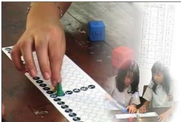
Fig. 8: Working in pairs: rolling the dice, moving the men, then representing the moves formally

The following transcription excerpt shows the discussion of: